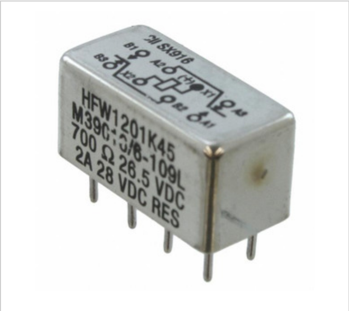
Imej mungkin perwakilan. Lihat spesifikasi untuk butiran produk.