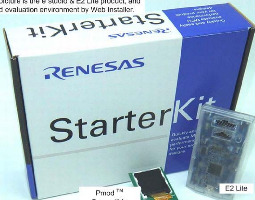
Pmod™ Compatible Color LCD board

This kit picture is the e 2 studio & E2 Lite product, and can build evaluation environment by Web Installer.