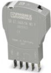
Electronic device circuit breaker, 1-pos., active current limitation, 1 N/O contact, plug for base element.

Please be informed that the data shown in this PDF Document is generated from our Online Catalog. Please find the complete data in the user's documentation. Our General Terms of Use for Downloads are valid ( http://download.phoenixcontact.com )